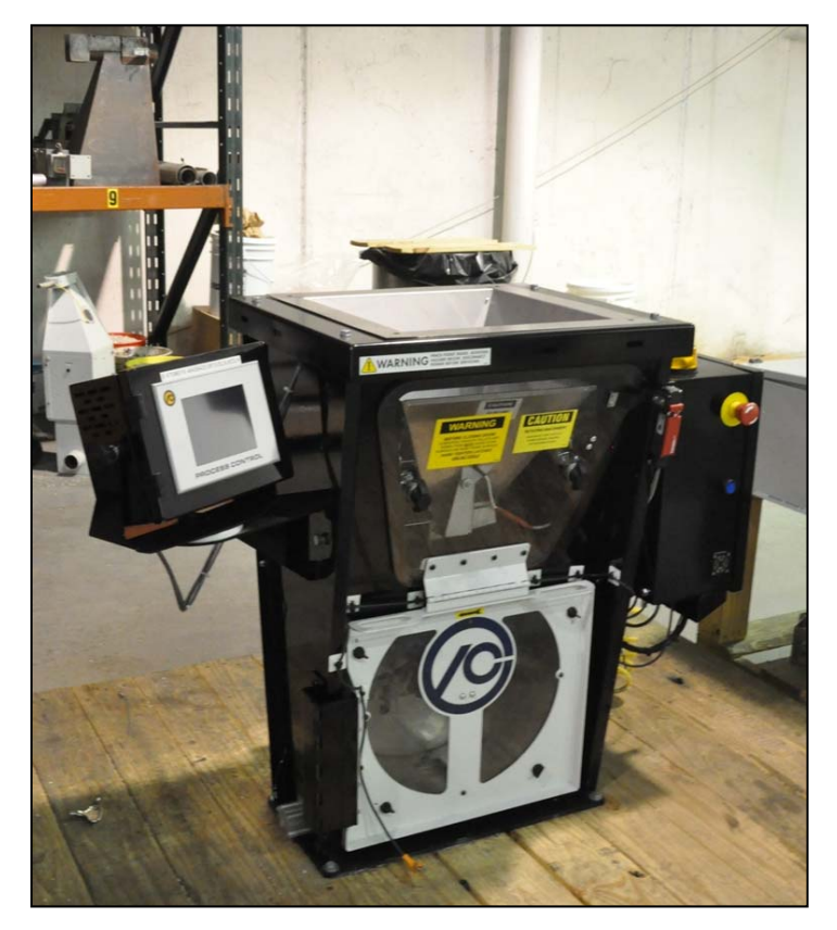
NOTE: Hoppers are to be built and included with order