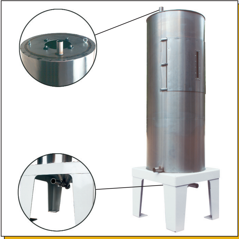
The HDA Series Dryer Hopper from Process Control provides processors with an accurate, energy efficient means of drying hygroscopic materials.

The HDA Series Dryer Hopper from Process Control Corporation is engineered to efficiently and effectively dry hygroscopic materials. The dryer hopper is a critical component in resin drying systems, affecting both drying performance and energy efficiency. Poor hopper performance can result in wasted energy and incomplete drying of the material.