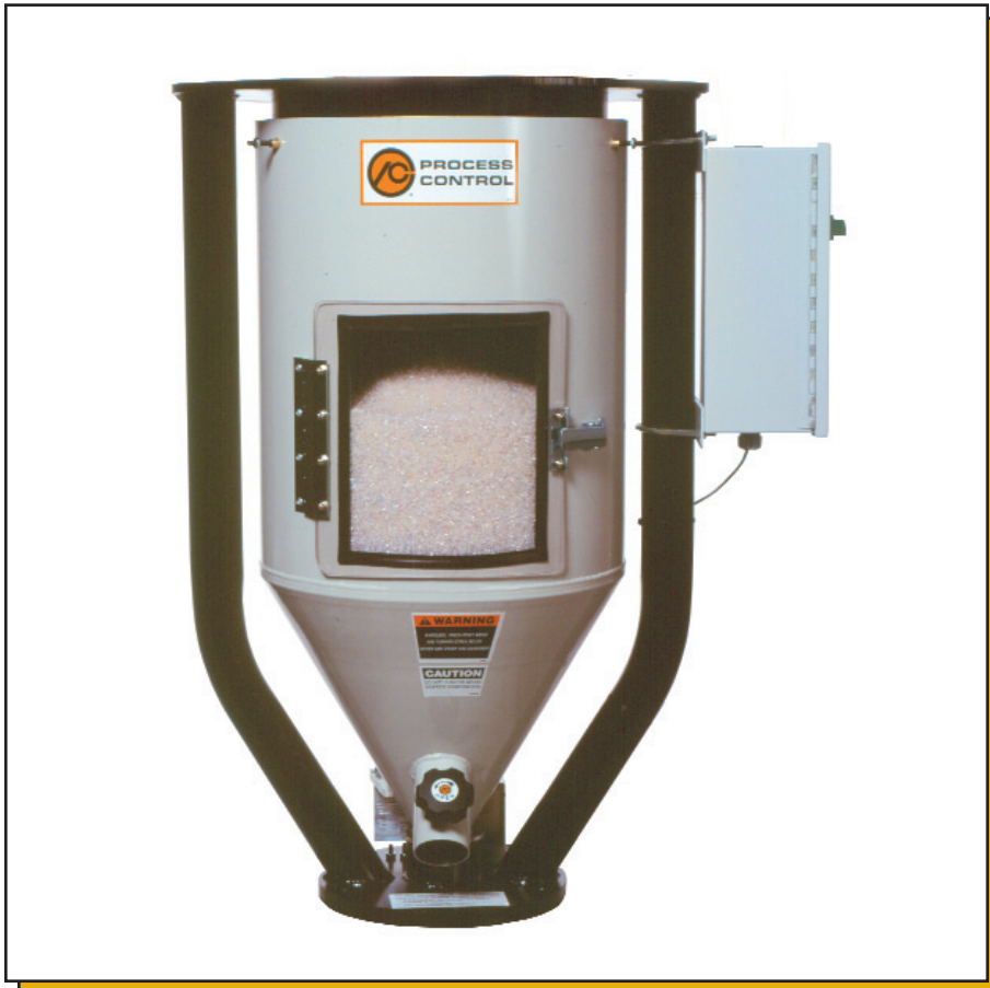
The HGB Series: the precise weigh hopper component of an integrated Gravitrol® system (picture above is an HGB023)

Designed for use as part of the Gravitrol® system, the HGB Series Weigh Hopper incorporates engineering and design breakthroughs to help achieve the optimal result in extrusion: a uniform product within tolerance at the lowest possible manufacturing cost.