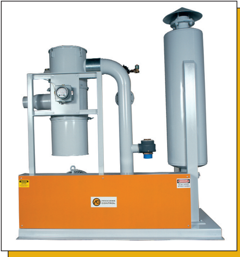
The VL Series: designed for use in a dual-blower system for conveying of plastic materials; part of a complete materials handling system (pictured above if a VL5055).

Process Control Corporation specializes in equipment for bulk conveying of plastic materials. Our conveying equipment is designed to stand up to the toughest demands of your application, including high material flow rates, multiple distribution points and long conveying distances.