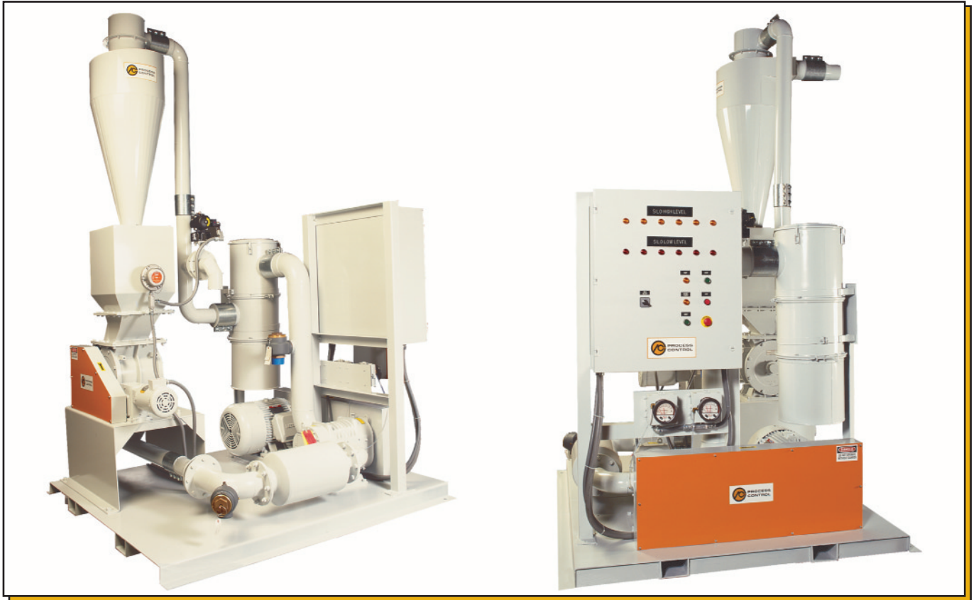
The VP Series: designed for bulk unloading plastics from trucks or railcars

Process Control's material handling equipment is specially designed for bulk conveying of plastic materials. Years of experience with plastics processors enables Process Control engineers to size conveying equipment for reliable, cost-effective loading of gravimetric and bulk systems.