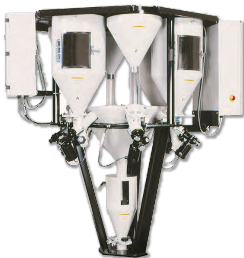
X SERIES ACCURACY \pm 0.5\%