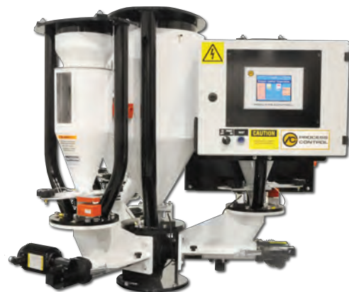
Z SERIES ACCURACY \pm 0.7\%

PLEASE ASK ABOUT OUR SPECIAL BLENDER FEATURES