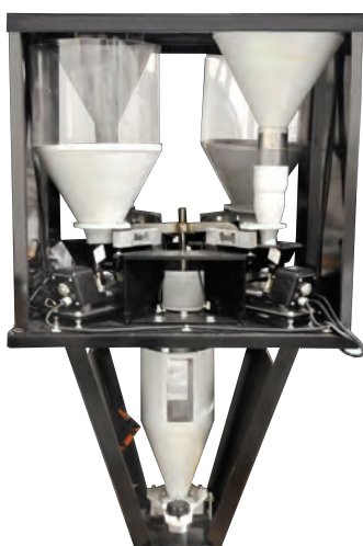
V SERIES ACCURACY \pm 0.7\%