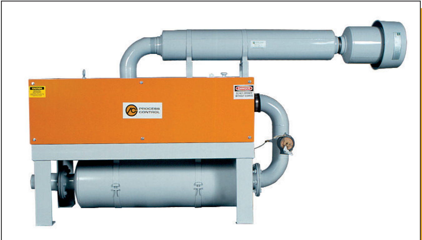
The P Series: pressure unit for conveying plastic materials (pictured is a P3040)

Process Control Corporation specializes in equipment for conveying plastic materials. Our equipment is designed to stand up to the toughest demands of your application, including high material flow rates, multiple distribution points and long conveying distances.