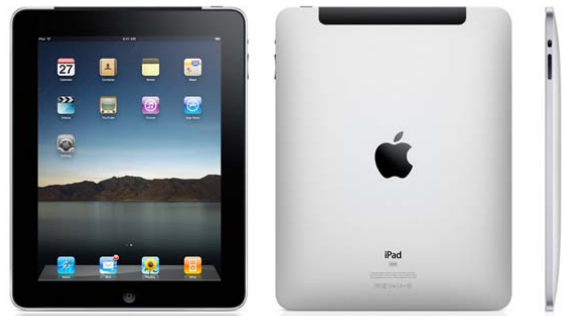
iPad2 Copyright © 2012 Apple

Process Control will also be giving away the THREE iPad 2 Tablets from the booth during the run of NPE. At the end of the each day, one winner will be randomly selected from the inquiry list from that day. The winner will be notified via email that evening and have their new iPad 2 shipped to them once the conference is over!